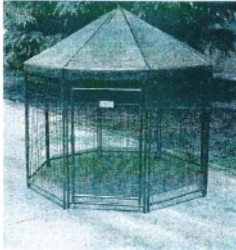
Figure 5 from Application

A second embodiment of the claimed portable animal kennel design shown with a roof feature covering the top portion is depicted in Figure 5: