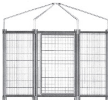
Figure 2 from D'006

NSIP Law is a full service intellectual property firm that specializes in the procurement of enforceable IP rights to protect innovations and investments pertaining to patents, trademarks, and copyrights.