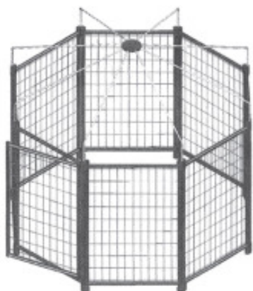
Figure 1 from D'006

On August 1, 2018, the U.S. Court of Appeals for the Federal Circuit held that the doctrine of prosecution history estoppel did not prevent the owner of a U.S. design patent from moving forward with its claim for design patent application. In Advantek Mktg. v. Shanghai Walk-Long Tools , Appeal No. 2017-1314 (Fed. Cir. 2018), Advantek Marketing sought to enforce its U.S. Patent No. D715,006 (“the ‘006 Patent”) for a portable animal kennel design. Figures 1 and 2 of the ‘006 Patent show the ornamental visual appearance of the portable kennel design that is claimed. That design has the general appearance of a gazebo.